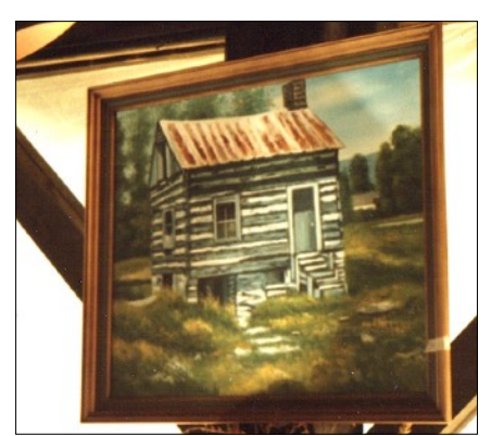
Painting of the Hoover cabin sold in 1984, at the Lord's Acre Festival.

About those surprising items donated? Some things that have been auctioned through the years include a calf, a pig, country hams, potatoes, jams and jellies, hot peppers, all kinds of produce, a baby cradle, tables and other wooden furniture, a painting of the Hoover cabin, and the annual quilt made