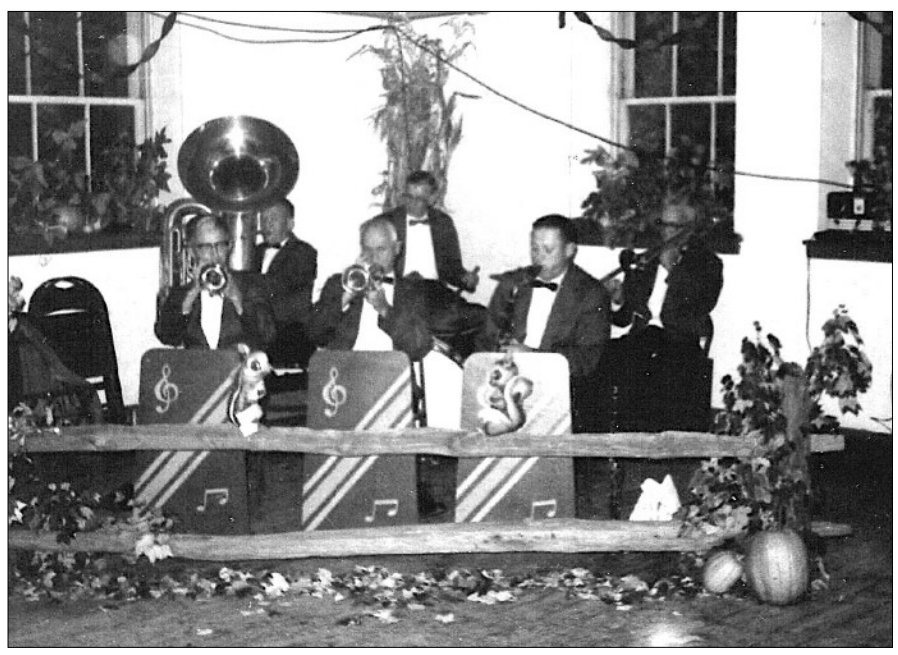
The Little German Band at the 1967 Lord's Acre Festival in the old schoolhouse.

It was agreed in 1961 to continue the festival, and for several years it followed the same format. The Little German Band