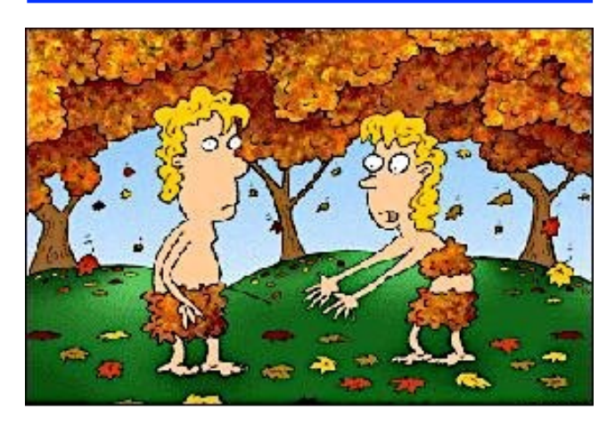
See Genesis 18:1-15

Will you please pick up all your clothes?