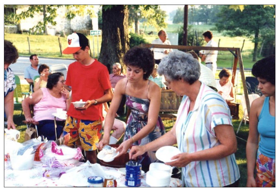
1987 Ice Cream Social on the parsonage front lawn.