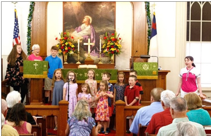
200th Anniversary July 28, 2019 — Children's Choir at the afternoon service.