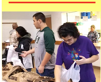
Salem Youth help with Potato Project p.7