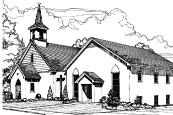
Salem United Methodist Church — Wolfsville