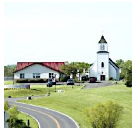
Martinsburg Campus of the United Methodist Board of Child Care

This service has been produced by the Bishop and Cabinet of the Baltimore-Washington Conference of the United Methodist Church.