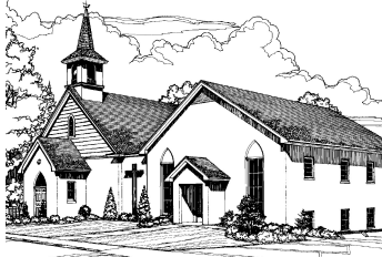
Salem United Methodist Church — Wolfsville