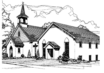
Salem United Methodist Church — Wolfsville