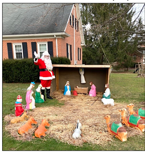
Hero's Club children were invited to come to Salem's manger scene in the parsonage front yard to receive Christmas gifts from Salem. To everyone's delight, Santa showed up to give the gifts to the children.