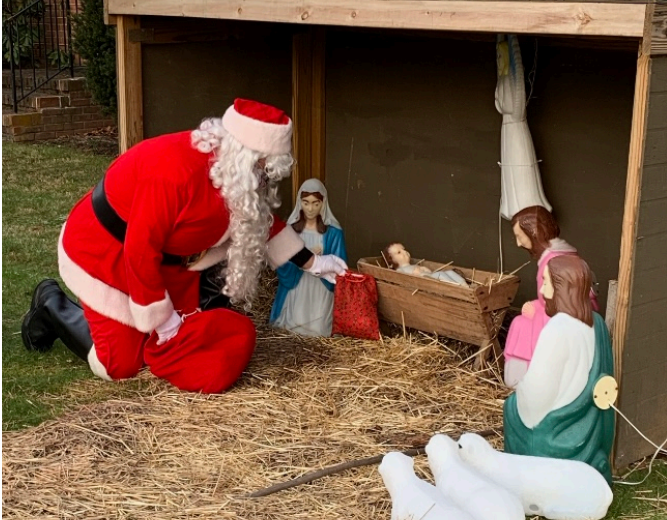
Santa, with his bag of gifts for Hero's Club children, places a gift at the manger of baby Jesus. The manger scene is in the parsonage front yard and is beautifully lighted at night.