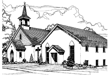
Salem United Methodist Church — Wolfsville