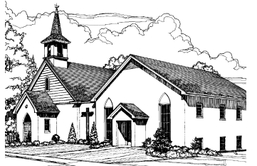
Salem United Methodist Church — Wolfsville