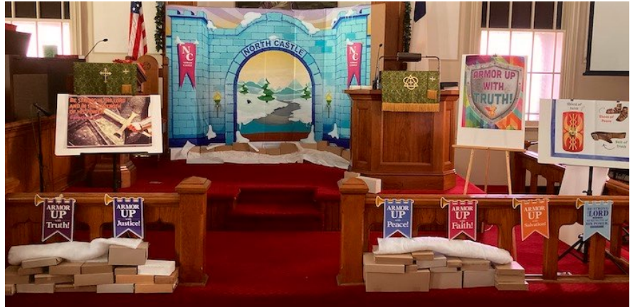
The Salem sanctuary is set up and ready for the first night of Vacation Bible School.