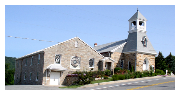
St. Mark's Lutheran Church 12704 Wolfsville Road

Wednesday evening November 24, 2021 7:00 p.m.