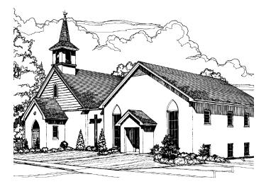
Salem United Methodist Church — Wolfsville