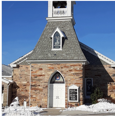
St. Mark's Lutheran Church 12704 Wolfsville Road

If snow forces cancellation, the recital will be held Saturday, Feb. 26, same time.