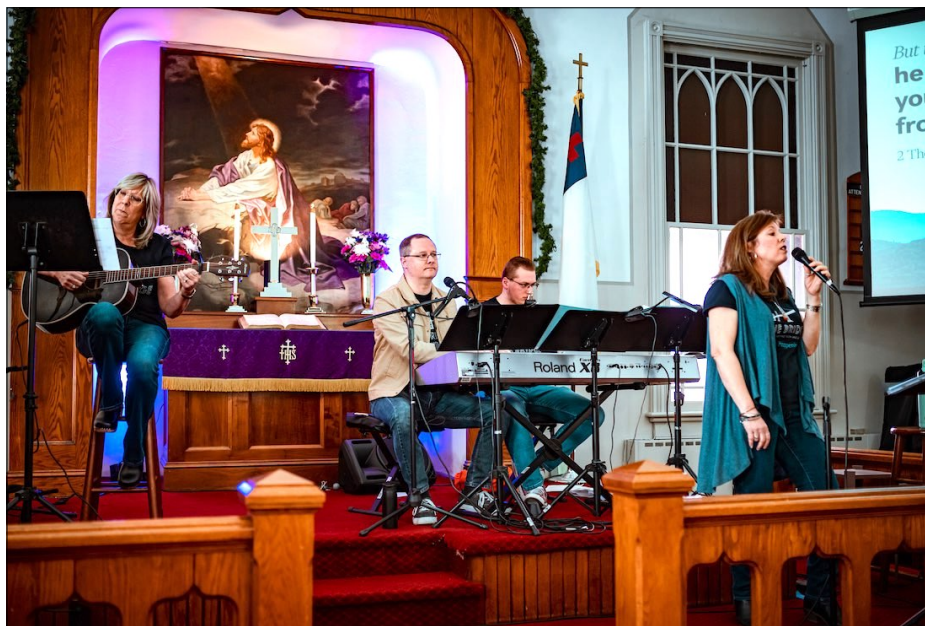
Salem’s “Works in Progress Praise Band” provided the music throughout the service.