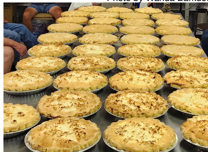
Count 'em, 38 Lord's Acre custard pies