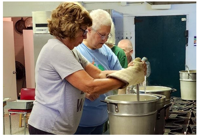
Making more soup.