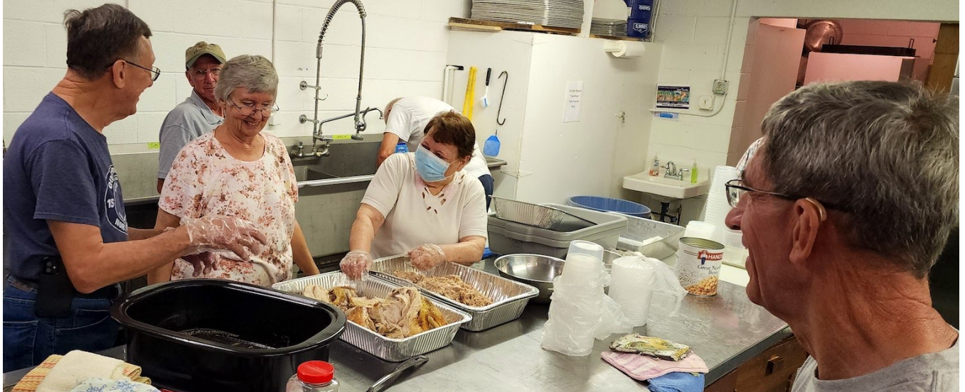
Preparing roasted turkeys for turkey salad sandwiches.