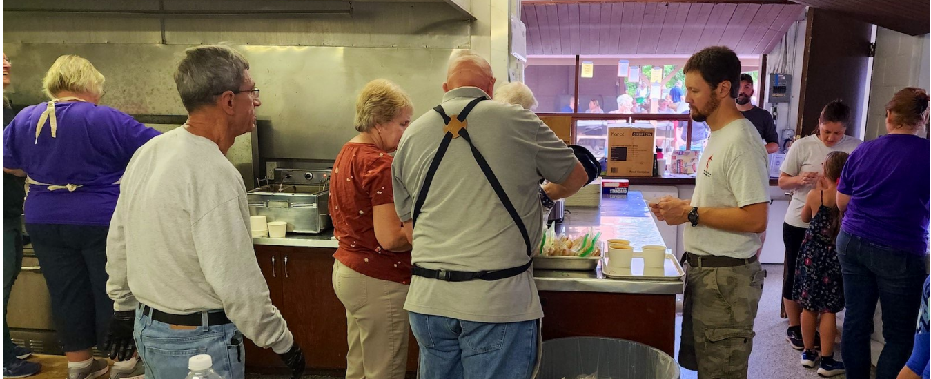
A flurry of activity serving customers from the Lord's Acre kitchen.