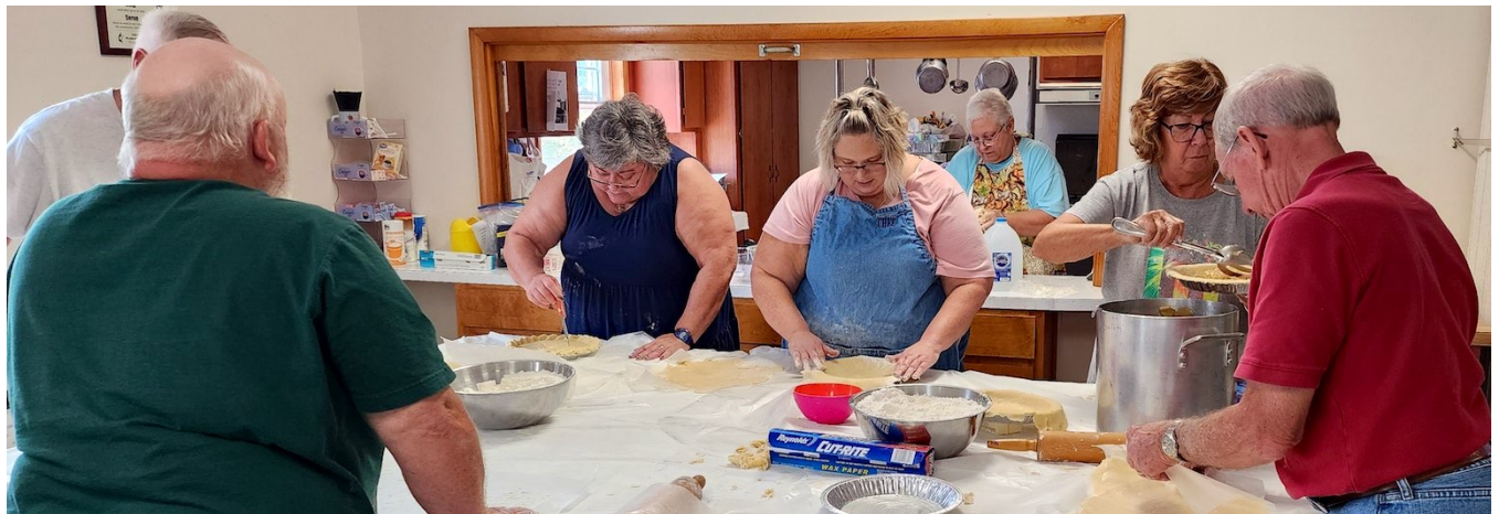
Making fruit pies.