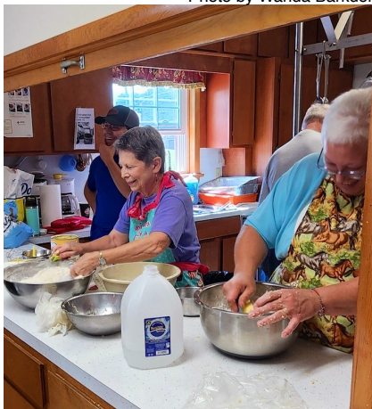
Making 51 Lord's Acre fruit pies