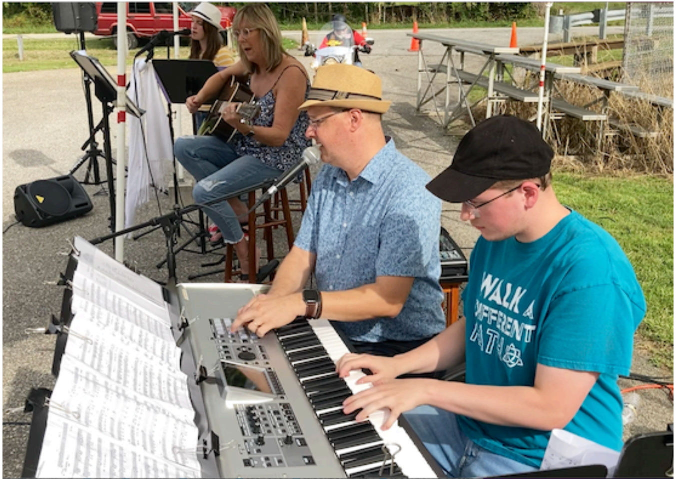
Music provided by Salem's "Works in Progress" Praise Band.