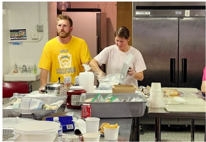
Preparing to serve pulled pork sandwiches.