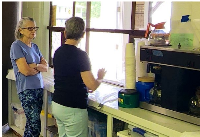
Working to set up to serve customers.