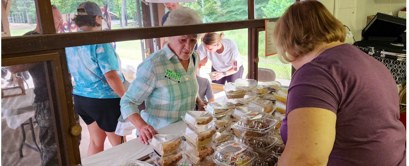
Sales of homemade baked goods are a good seller.