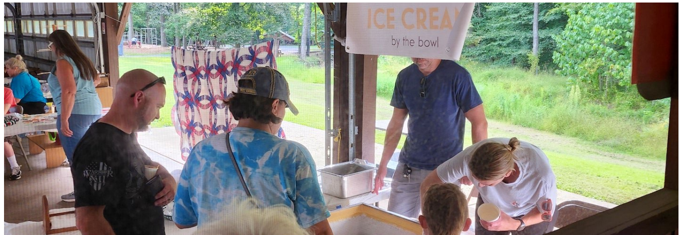
Dipping ice cream by the bowl for a Lord's Acre customer family.