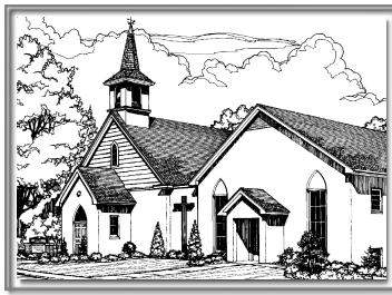
Salem United Methodist Church — Wolfsville