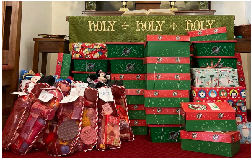
Salem Mission Projects No. 2 & 3