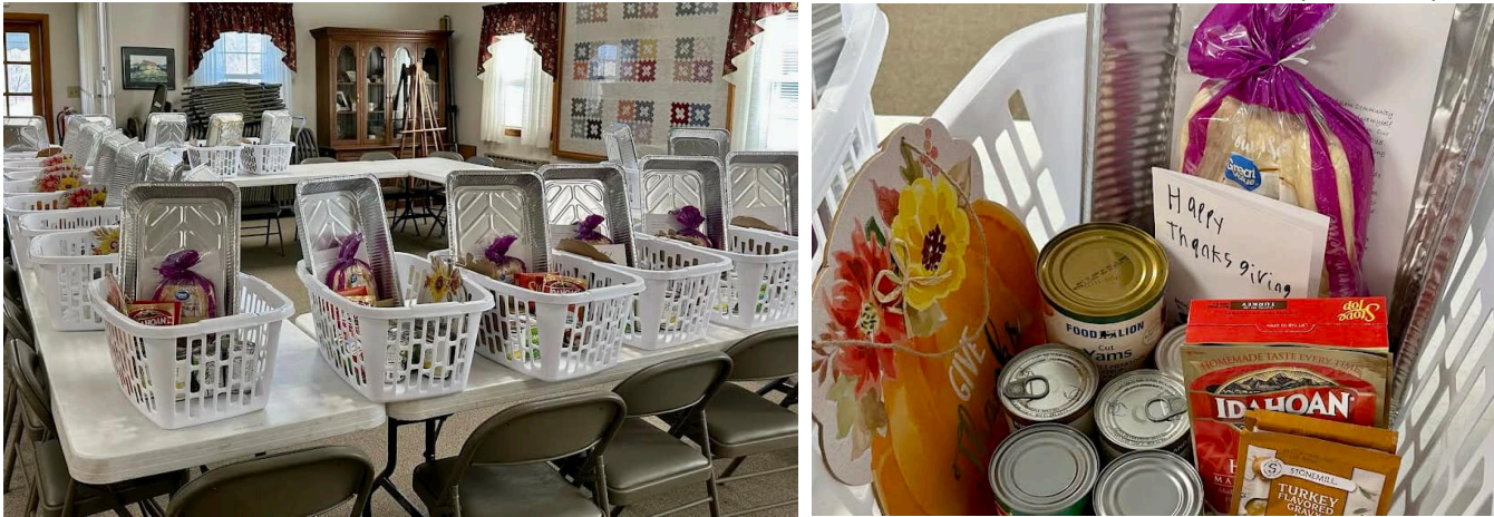
Sharing Christ's love as volunteers packed Thanksgiving Baskets for our Food Pantry patrons this holiday season.