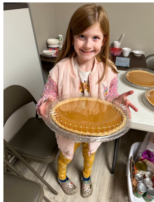
A pumpkin pie topped off the Thanksgiving baskets.

We greatly appreciate everyone who donated a turkey, helped pack baskets, and helped with distributing the baskets on Monday evening, November 20th.