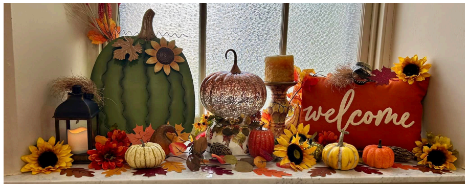
Salem’s sanctuary windows were beautifully decorated with a harvest theme.

It was a beautiful testament to the enduring faithfulness of God and the faithfulness, legacy and unbreakable bonds that unite Salem members across generations. To God be the glory.