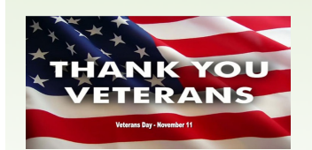
In Honor of Veterans Day • Nov 11 Article on page 8