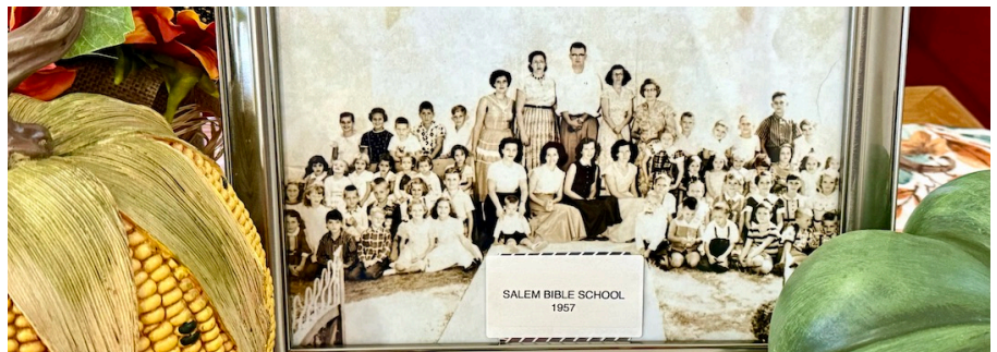
An item of conversation was a photo of the Wolfsville Community Bible School taken at Salem in 1957. Folks were identifying many recognizable faces.