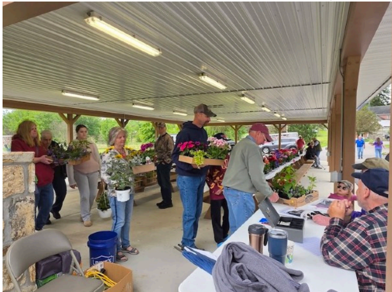
Check out line at the flower & plant sale.