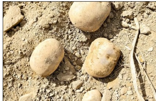
Potatoes left behind by harvesting machines.

More than one-third of all food grown in the U.S. is lost as waste, yet hunger remains a daily reality for many. Volunteers on the Potato Project go into the fields and glean perfectly good potatoes left behind by the harvesting machines.